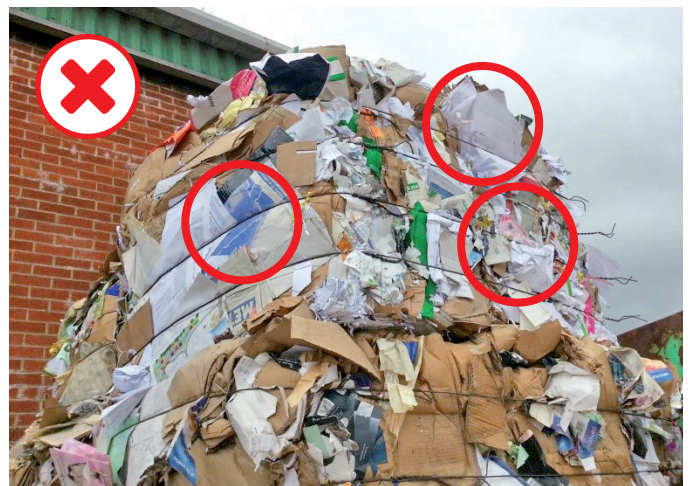
Bale not manila in appearance, more than 5% paper and waxed greeting cards. Grade more consistent with mixed papers.